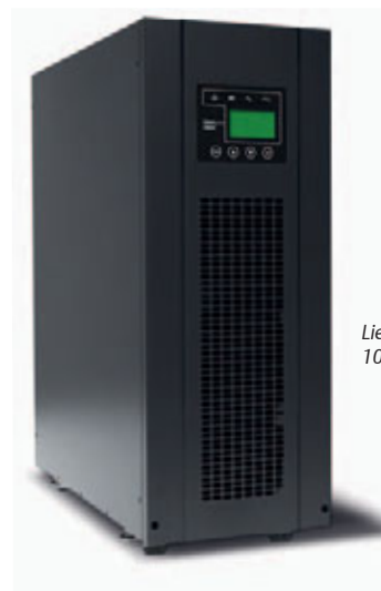
Liebert GXT3 10000 VA Tower