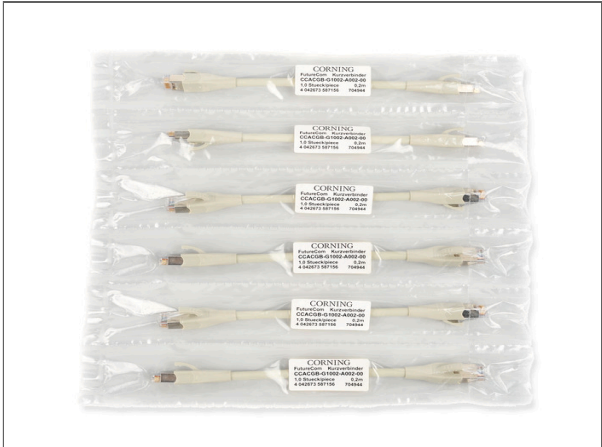
FutureCom™ Extra Short Connection Cords, FRNC, RJ45 - RJ45 connector, grey, 0.2 m