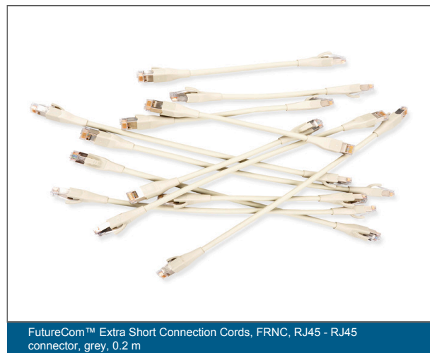
FutureCom™ Extra Short Connection Cords, FRNC, RJ45 - RJ45 connector, grey, 0.2 m