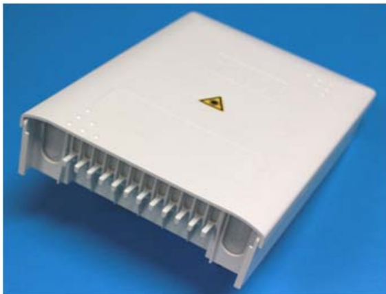
Symetric PBPO NG with external anchoring