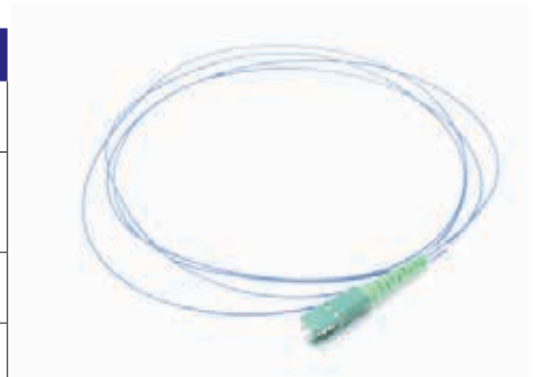
3M™ SC/APC 900 μm Buffer Pigtail