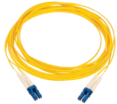
3M™ LC/UPC to LC/UPC 2.0 mm Jacketed Duplex Patch Cord