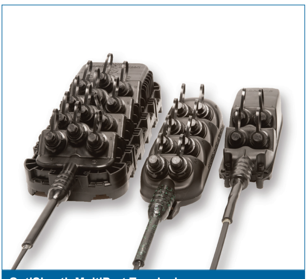
OptiSheath MultiPort Terminals | Photo TRCLS024

Designed and third-party tested to requirements of Telcordia GR-771-CORE, Issue 1