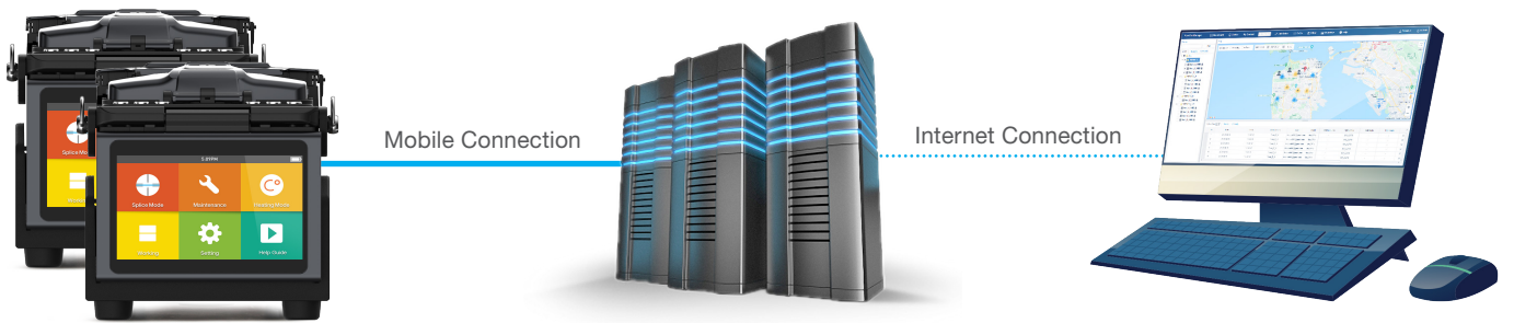
INNO's Pro Series Splicers

View Pro Management System is an integrated cloud-based software platform for INNO's splicers. This innovative web-based application allows both technicians and managers of the splicers to maximize the use of its assets and to achieve the highest work efficiency. Real-time communications with tiered access rights and options to manage job orders, manage splicing machines, and send/receive reports are only a small part of the innovative work processes offered by the View Pro.